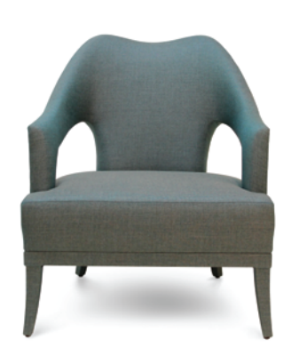
N°20 | ARMCHAIR

CASEGOODS UPHOLSTERY LIGHTING RUGS ART ACCESSORIES